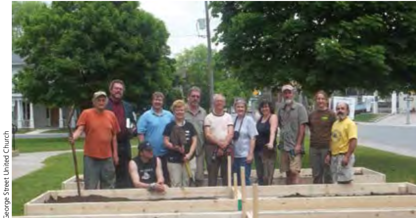
George Street United Church

The Foundation helps provide grants through the Seeds of Hope granting program. Here is a story of some of the life-giving changes resulting from one such grant.